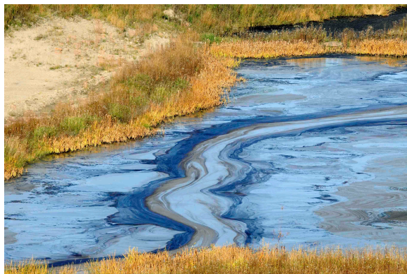
Hydrophobic sand was invented to clean up oil spills

Hydrophobic sand has also been used to protect utilities in cold climates. Electrical junction boxes can be covered with a layer of coated sand, then capped with a few inches of soil. The hydrophobic sand can be dug through even when the ground is frozen, making repairs easier.