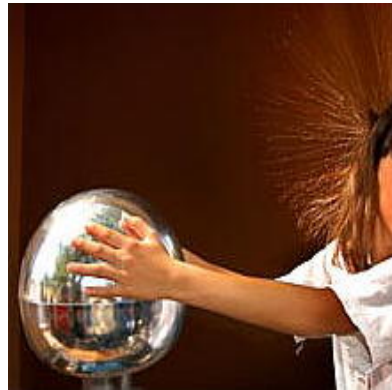
Photo: A classic demonstration of static electricity you may have seen in your school. When this girl touches the metal ball of a Van de Graaff static electricity generator, she receives a huge static electric charge and her hair literally stands on end! Each strand of hair gets the same static charge and like charges repel, so her hairs push away from one another.

When you rub a balloon on your clothing, this leaves the balloon with slightly too few electrons. Since electrons are negatively charged, having too few electrons makes the balloon slightly positively charged. Your clothing meanwhile gains these extra electrons and becomes negatively charged. Opposite charges attract, so your clothing sticks to the balloon. That's a very brief introduction to static electricity.