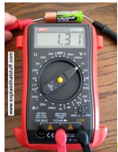
Photo: You can use a digital multimeter like this to measure voltage, current, and resistance.