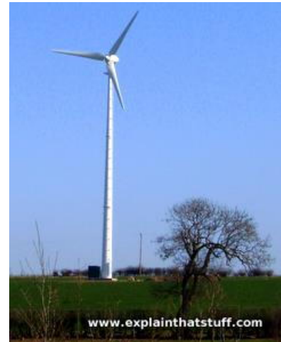
Photo: Making clean, renewable energy from the wind. Each of these turbines contains an electricity generator in the top section, just behind the spinning rotors.

Unlike virtually every other way of making electricity, solar cells (like the ones on calculators and digital watches) do not work using electricity generators and magnetism. When light falls on a solar cell, the material it is made from (silicon) captures the light's energy and turns it directly into electricity. Potentially, this means solar cells are an extremely efficient way to make electricity. A home with solar electric panels on the roof might be able to make most of its own electricity, for example.