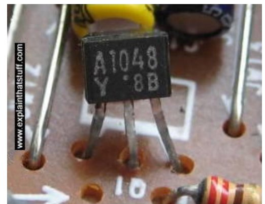
Photo: A transistor (a typical electronic component) on a circuit board. Components like this run on electricity, just like clothes washing machines, but they use much smaller currents and voltages.

Electricity is about using relatively large currents of electrical energy to do useful jobs, like driving a washing machine or powering an electric drill. Electronics is a very different kind of electricity. It's a way of controlling things using incredibly tiny currents of electricity—sometimes even individual electrons! Suppose you have an electronic clothes washing machine. Large