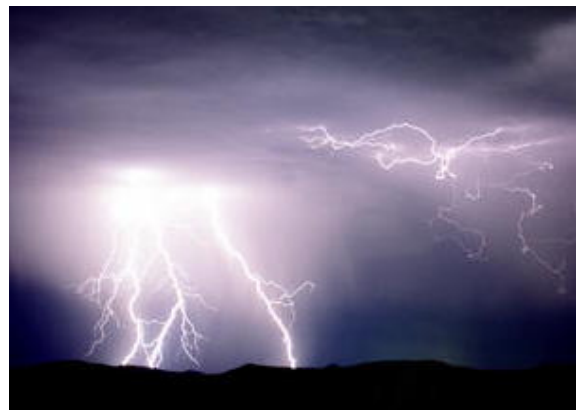
Photo: Lightning in South Lakewood, Colorado.

Lightning is also caused by static electricity. As rain clouds move through the sky, they rub against the air around them. This makes them build up a huge electric charge. Eventually, when the charge is big enough, it leaps to Earth as a bolt of lightning. You can often feel the tingling in the air when a storm is brewing nearby. This is the electricity in the air around you.